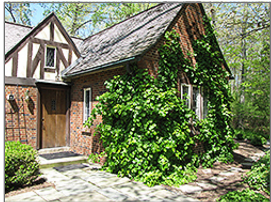
Climbing Hydrangea