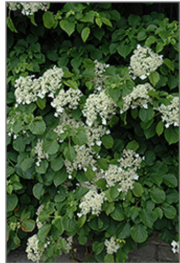
Climbing Hydrangea flowers