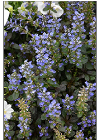
Chocolate Chip Bugleweed flowers

Chocolate Chip Bugleweed is recommended for the following landscape applications;