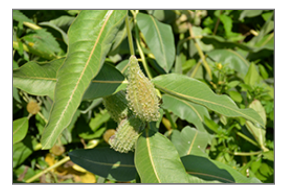
Showy Milkweed fruit

Begick Nursery 5993 West Side Saginaw Rd. Bay City, MI 48706 989.684.4210