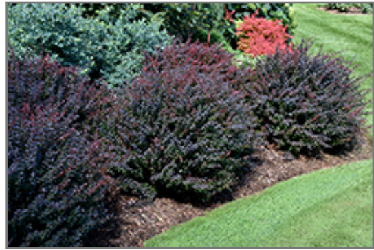
Sunjoy Mini Maroon Japanese Barberry

Sunjoy Mini Maroon Japanese Barberry is recommended for the following landscape applications;