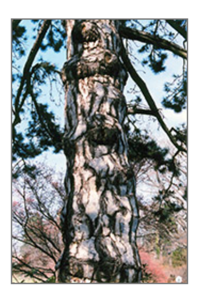
Austrian Pine bark