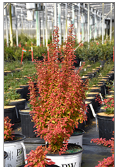
Sunjoy Orange Pillar Japanese Barberry