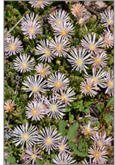
Alan's Apricot Ice Plant flowers