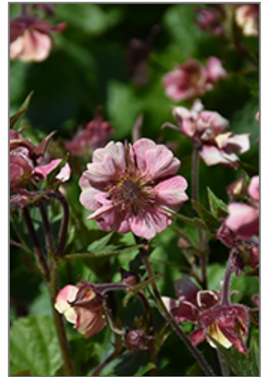
Tempo Rose Avens flowers

Tempo Rose Avens is recommended for the following landscape applications;