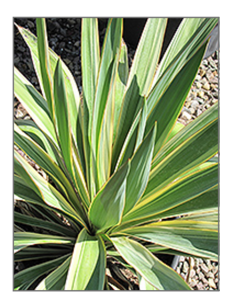
Color Guard Adam's Needle

This shrub should only be grown in full sunlight. It prefers dry to average moisture levels with very well-drained soil, and will often die in standing water. It is considered to be drought-tolerant, and thus makes an ideal choice for a low-water garden or xeriscape application. It is not particular as to soil type or pH. It is somewhat tolerant of urban pollution. This is a selection of a native North American species.