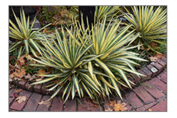
Color Guard Adam's Needle

Color Guard Adam's Needle is recommended for the following landscape applications;