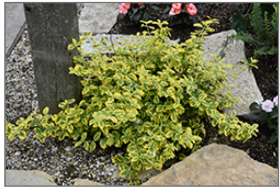
Gold Splash Wintercreeper