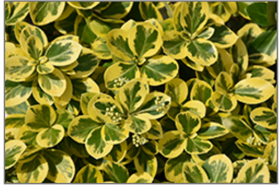
Gold Splash Wintercreeper flower buds

This shrub performs well in both full sun and full shade. It is very adaptable to both dry and moist locations, and should do just fine under typical garden conditions. It is not particular as to soil type or pH. It is highly tolerant of urban pollution and will even thrive in inner city environments, and will benefit from being planted in a relatively sheltered location. This is a selected variety of a species not originally from North America.