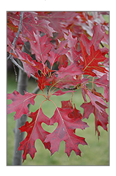
Northern Pin Oak in fall