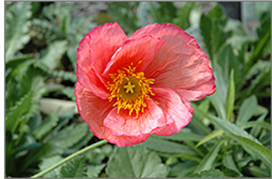
Champagne Bubbles Poppy flowers

Champagne Bubbles Poppy will grow to be only 6 inches tall at maturity extending to 18 inches tall with the flowers, with a spread of 18 inches. When grown in masses or used as a bedding plant, individual plants should be spaced approximately 14 inches apart. It grows at a fast rate, and under ideal conditions can be expected to live for approximately 3 years. As an herbaceous perennial, this plant will usually die back to the crown each winter, and will regrow from the base each spring. Be careful not to disturb the crown in late winter when it may not be readily seen! As this plant tends to go dormant in summer, it is best interplanted with late-season bloomers to hide the dying foliage.