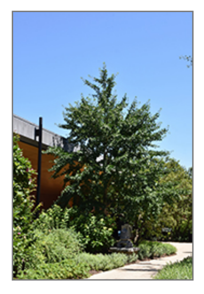
Autumn Gold Ginkgo

Begick Nursery 5993 West Side Saginaw Rd. Bay City, MI 48706 989.684.4210