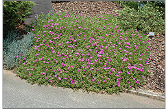
Purple Ice Plant in bloom

Purple Ice Plant will grow to be only 2 inches tall at maturity extending to 3 inches tall with the flowers, with a spread of 24 inches. Its foliage tends to remain low and dense right to the ground. It grows at a fast rate, and under ideal conditions can be expected to live for approximately 5 years. As an evergreen perennial, this plant will typically keep its form and foliage year-round.